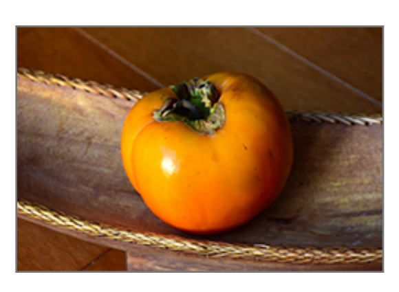
Giant Fuyu Japanese Persimmon fruit

A popular cultivar producing large, deep orange fruit; flowers in mid-summer and fruit ripens in mid-November; typically round-topped with an open, erect habit; fruit has a sweet honey flavor, delicious for fresh eating or preserves