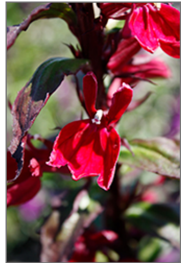
Starship Burgundy Lobelia flowers

Starship Burgundy Lobelia is recommended for the following landscape applications;