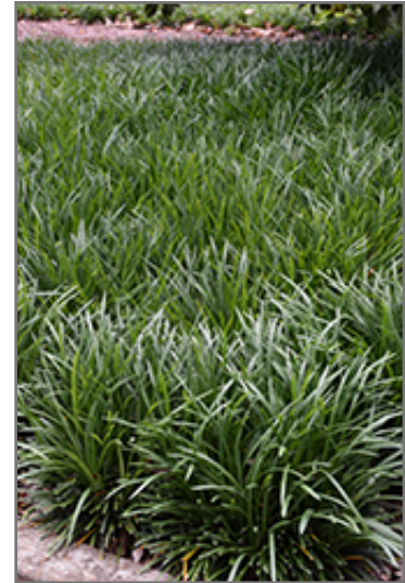
Super Blue Lily Turf