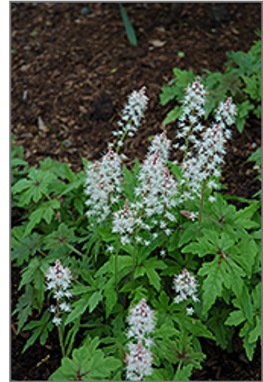
Iron Butterfly Foamflower flowers