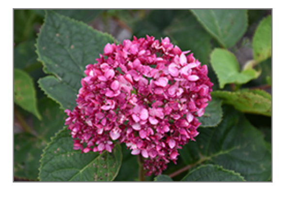
Invincibelle Garnetta Smooth Hydrangea flowers

Invincibelle Garnetta Smooth Hydrangea is a multi-stemmed deciduous shrub with a more or less rounded form. Its strikingly bold and coarse texture can be very effective in a balanced landscape composition.