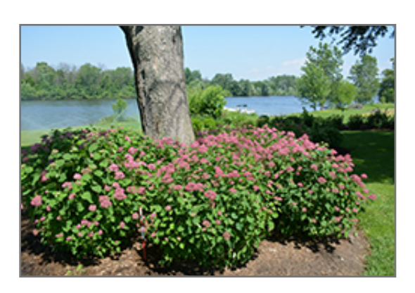
Invincibelle Garnetta Smooth Hydrangea in bloom

This shrub will require occasional maintenance and upkeep, and is best pruned in late winter once the threat of extreme cold has passed. It has no significant negative characteristics.