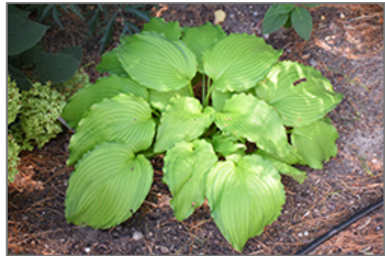
First Dance Hosta

First Dance Hosta is recommended for the following landscape applications;