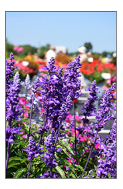
Icon Violet Salvia flowers

This uniform selection is perfect for adding a pop of color to borders, patio containers and garden landscapes; a compact, upright habit features tall spikes of beautiful violet flowers rising above green foliage; a low maintenance, pollinator attractor