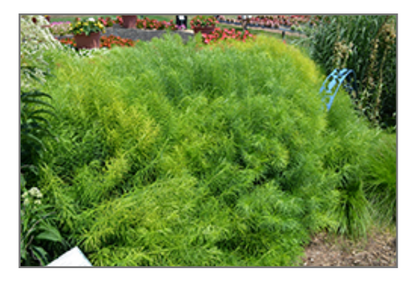
Narrow-Leaf Blue Star

Narrow-Leaf Blue Star will grow to be about 24 inches tall at maturity, with a spread of 24 inches. Its foliage tends to remain dense right to the ground, not requiring facer plants in front. It grows at a slow rate, and under ideal conditions can be expected to live for approximately 20 years. As an herbaceous perennial, this plant will usually die back to the crown each winter, and will regrow from the base each spring. Be careful not to disturb the crown in late winter when it may not be readily seen!