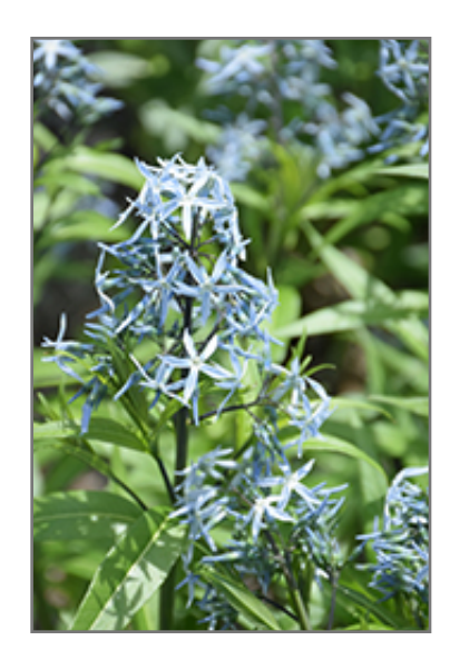
Narrow-Leaf Blue Star flowers