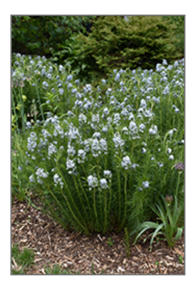
Narrow-Leaf Blue Star in bloom

This is a relatively low maintenance plant, and should be cut back in late fall in preparation for winter. Deer don't particularly care for this plant and will usually leave it alone in favor of tastier treats. It has no significant negative characteristics.