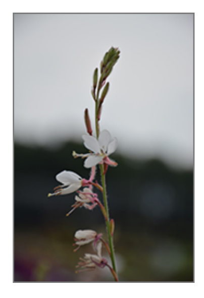
Grace Haze Gaura flowers

This is a relatively low maintenance plant, and is best cleaned up in early spring before it resumes active growth for the season. It is a good choice for attracting butterflies to your yard, but is not particularly attractive to deer who tend to leave it alone in favor of tastier treats. It has no significant negative characteristics.