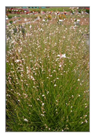
Grace Haze Gaura in bloom