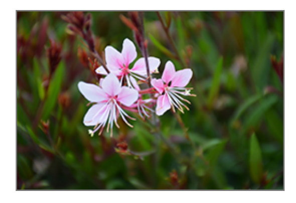
Grace Blush Gaura flowers

Grace Blush Gaura is recommended for the following landscape applications;