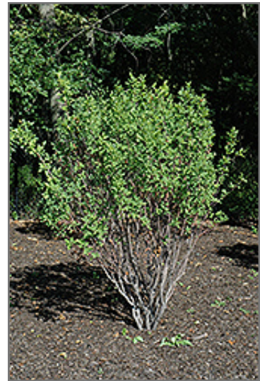
Rainbow Pillar Serviceberry

Rainbow Pillar Serviceberry is a dense multi-stemmed deciduous shrub with a narrowly upright and columnar growth habit. Its relatively fine texture sets it apart from other landscape plants with less refined foliage.