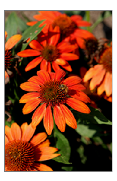
Sombrero Fiesta Orange Coneflower flowers

Sombrero Fiesta Orange Coneflower is an herbaceous perennial with an upright spreading habit of growth. Its medium texture blends into the garden, but can always be balanced by a couple of finer or coarser plants for an effective composition.