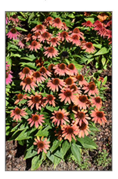
Sombrero Fiesta Orange Coneflower in bloom