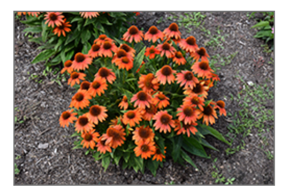
Sombrero Fiesta Orange Coneflower in bloom