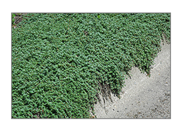
Vail Valley Thyme

Vail Valley Thyme is smothered in stunning lilac purple flowers at the ends of the stems from early to late summer. Its attractive tiny fragrant round leaves remain bluish-green in colour throughout the year.