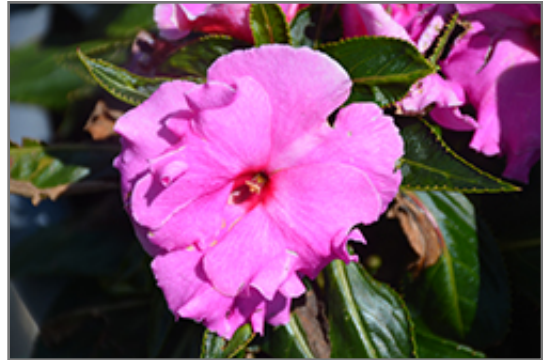
Roller Coaster Valravv Violet Impatiens flowers