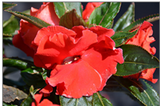
Roller Coaster Red Racer Impatiens flowers