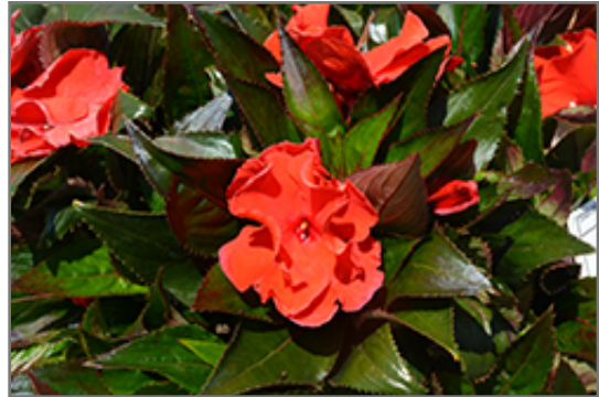
Roller Coaster Red Racer Impatiens flowers

Roller Coaster Red Racer Impatiens is recommended for the following landscape applications;