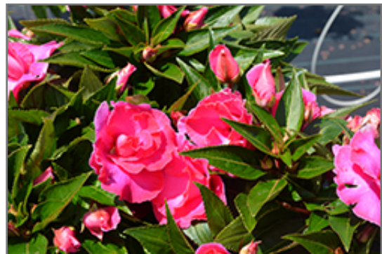
Roller Coaster Hot Pink Impatiens flowers