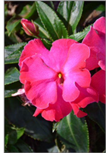
Roller Coaster Hot Pink Impatiens flowers

Roller Coaster Hot Pink Impatiens is recommended for the following landscape applications;