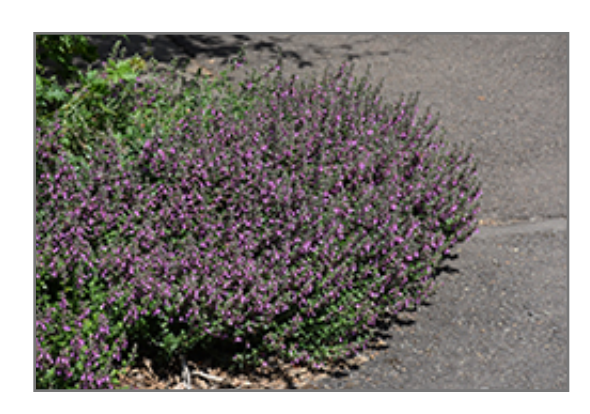
Creeping Germander in bloom

Creeping Germander will grow to be about 10 inches tall at maturity, with a spread of 18 inches. It grows at a medium rate, and under ideal conditions can be expected to live for approximately 10 years. As an evegreen perennial, this plant will typically keep its form and foliage year-round.