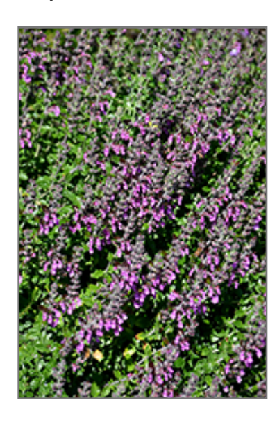
Creeping Germander flowers