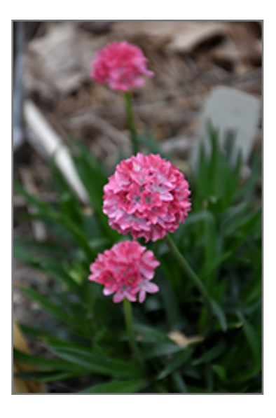
Dreameria Dreamland False Sea Thrift flowers

A breakthrough series, providing beautiful blooms from frost to frost; remove old flowers once a month for best re-blooming performance; perfect for massing in the garden or containers; very heat tolerant, and easy to grow