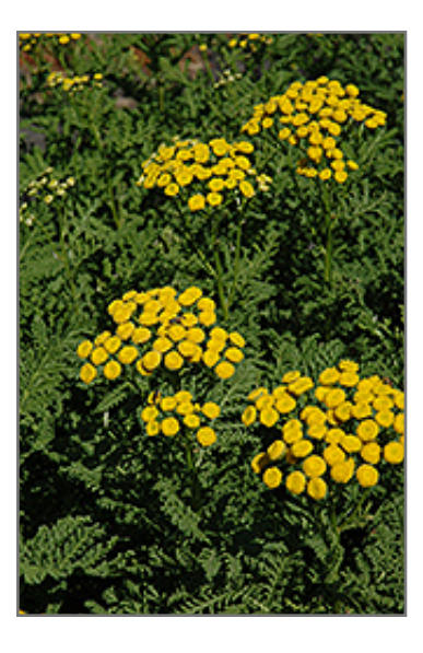
Crispleaf Tansy flowers

Crispleaf Tansy has masses of beautiful yellow button flowers at the ends of the stems from early to late summer, which are most effective when planted in groupings. The flowers are excellent for cutting. Its attractive fragrant ferny pinnately compound leaves remain grayish green in colour throughout the season.