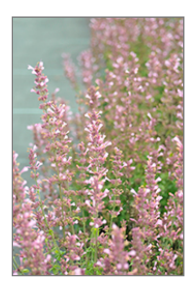
Sunrise Salmon Pink Hyssop flowers

Tall spikes of nectar rich salmon and pink flowers with burgundy calyxes held above compact mounds of green, licorice scented foliage; attracts pollinators to the garden