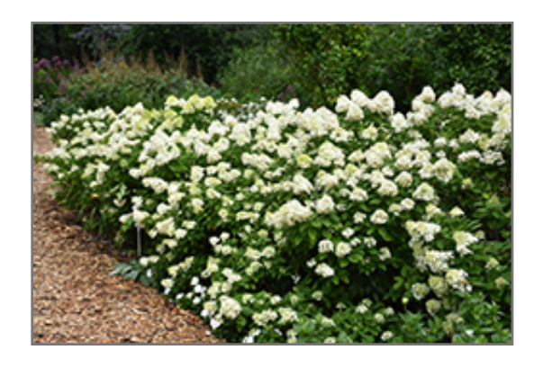
Limelight Prime Hydrangea in bloom