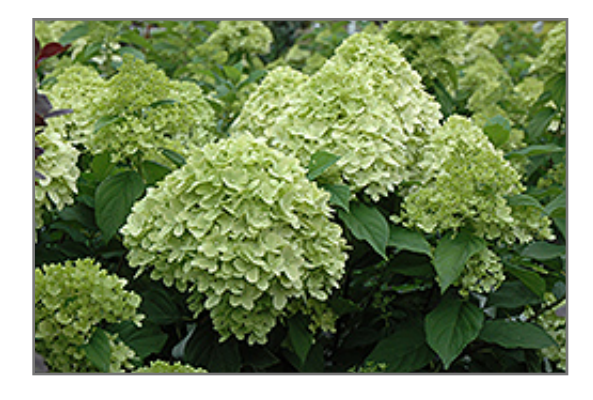
Limelight Prime Hydrangea flowers

This shrub performs well in both full sun and full shade. It prefers to grow in average to moist conditions, and shouldn't be allowed to dry out. It is not particular as to soil type or pH. It is highly tolerant of urban pollution and will even thrive in inner city environments. Consider applying a thick mulch around the root zone in winter to protect it in exposed locations or colder microclimates. This is a selected variety of a species not originally from North America.