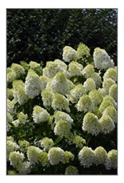
Limelight Prime Hydrangea flowers