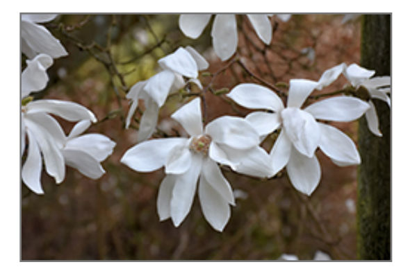
Slavin's Snowy Magnolia flowers

Slavin's Snowy Magnolia is recommended for the following landscape applications;