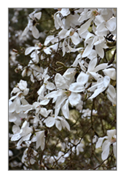
Slavin's Snowy Magnolia flowers