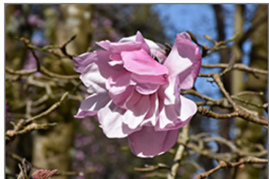
Caerhay's Belle Magnolia flowers