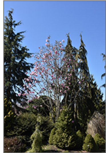
Caerhay's Belle Magnolia in bloom

This tree does best in full sun to partial shade. It requires an evenly moist well-drained soil for optimal growth, but will die in standing water. It is not particular as to soil type, but has a definite preference for acidic soils. It is quite intolerant of urban pollution, therefore inner city or urban streetside plantings are best avoided. Consider applying a thick mulch around the root zone in winter to protect it in exposed locations or colder microclimates. This particular variety is an interspecific hybrid.