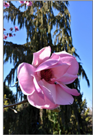
Caerhay's Belle Magnolia flowers

This is a relatively low maintenance tree, and should only be pruned after flowering to avoid removing any of the current season's flowers. Deer don't particularly care for this plant and will usually leave it alone in favor of tastier treats. It has no significant negative characteristics.