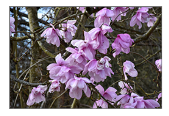
Sargent's Magnolia flowers

Sargent's Magnolia will grow to be about 35 feet tall at maturity, with a spread of 35 feet. It has a low canopy with a typical clearance of 5 feet from the ground, and should not be planted underneath power lines. It grows at a medium rate, and under ideal conditions can be expected to live for 80 years or more.