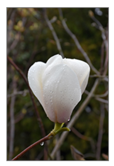
David Clulow Magnolia flowers

David Clulow Magnolia will grow to be about 25 feet tall at maturity, with a spread of 25 feet. It has a low canopy with a typical clearance of 3 feet from the ground, and is suitable for planting under power lines. It grows at a medium rate, and under ideal conditions can be expected to live for 50 years or more.