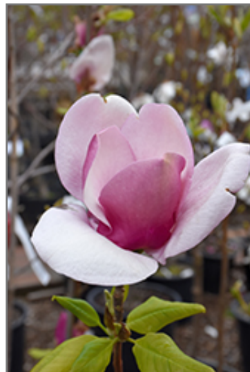
Cameo Magnolia flowers

Cameo Magnolia will grow to be about 15 feet tall at maturity, with a spread of 8 feet. It has a low canopy with a typical clearance of 2 feet from the ground, and is suitable for planting under power lines. It grows at a slow rate, and under ideal conditions can be expected to live for 50 years or more.