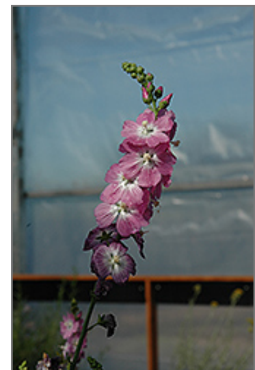
Stark's Hybrids Prairie Mallow flowers