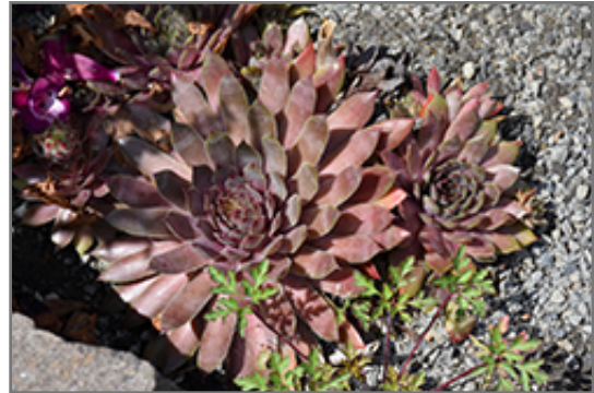
Kalinda Hens And Chicks