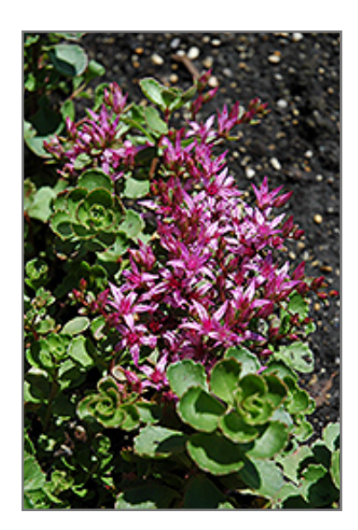
Red Form Stonecrop flowers

Red Form Stonecrop is smothered in stunning cherry red star-shaped flowers at the ends of the stems from early to mid summer. Its attractive tiny succulent round leaves emerge brick red in spring, turning dark green in colour with distinctive dark red edges. As an added bonus, the foliage turns a gorgeous dark red in the fall.