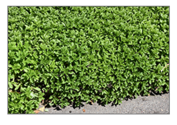
Selskian Stonecrop

Selskian Stonecrop is a dense herbaceous perennial with a mounded form. It brings an extremely fine and delicate texture to the garden composition and should be used to full effect.