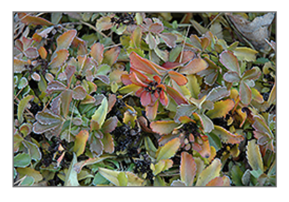
Selskian Stonecrop in fall

This is a relatively low maintenance plant, and is best cleaned up in early spring before it resumes active growth for the season. Deer don't particularly care for this plant and will usually leave it alone in favor of tastier treats. It has no significant negative characteristics.