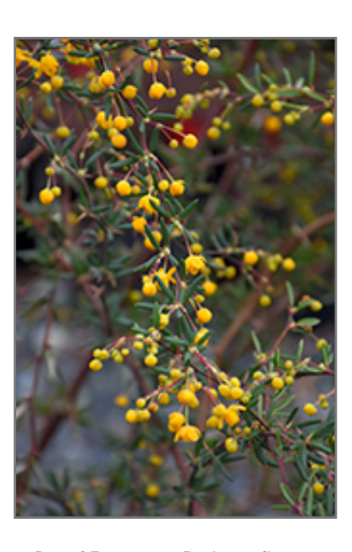
Dwarf Rosemary Barberry flowers

Dwarf Rosemary Barberry features tiny clusters of yellow flowers hanging below the branches in mid spring, which emerge from distinctive gold flower buds. It has attractive dark green evergreen foliage. The tiny narrow leaves are highly ornamental and remain dark green throughout the winter. The fruits are showy black drupes carried in abundance from early to late fall.