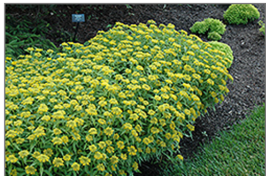
Aizoon Stonecrop in bloom