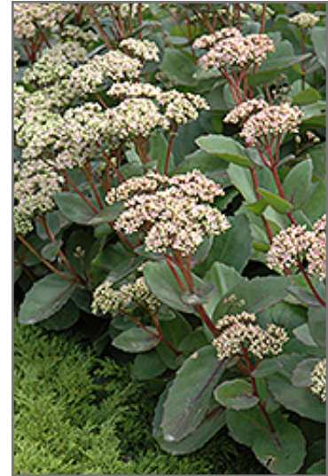
Matrona Stonecrop flowers

Matrona Stonecrop is a fine choice for the garden, but it is also a good selection for planting in outdoor pots and containers. With its upright habit of growth, it is best suited for use as a 'thriller' in the 'spiller-thriller-filler' container combination; plant it near the center of the pot, surrounded by smaller plants and those that spill over the edges. Note that when growing plants in outdoor containers and baskets, they may require more frequent waterings than they would in the yard or garden. Be aware that in our climate, most plants cannot be expected to survive the winter if left in containers outdoors, and this plant is no exception. Contact our experts for more information on how to protect it over the winter months.