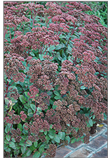
Matrona Stonecrop flowers

Matrona Stonecrop is recommended for the following landscape applications;