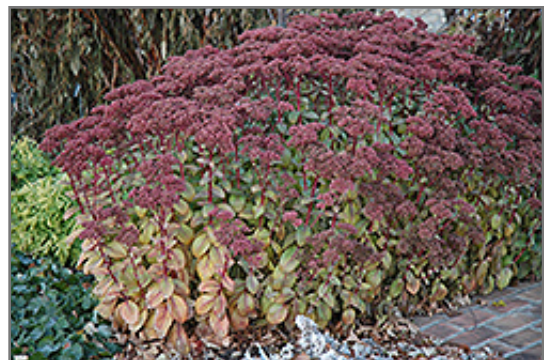
Matrona Stonecrop in fall