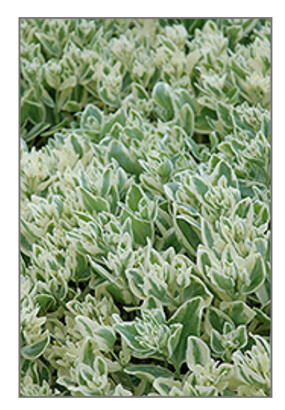
Frosty Morn Stonecrop foliage