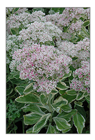
Frosty Morn Stonecrop flowers