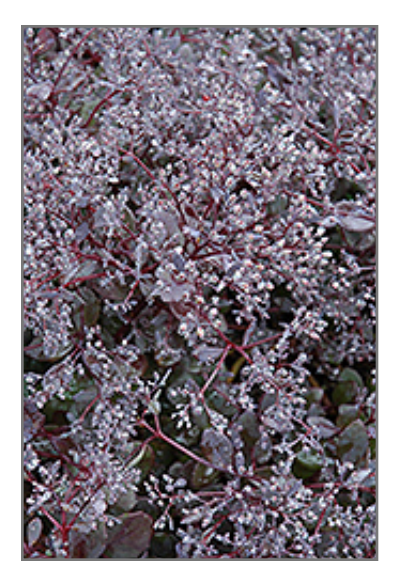
Bertram Anderson Stonecrop flowers

This is a relatively low maintenance plant, and is best cleaned up in early spring before it resumes active growth for the season. It is a good choice for attracting bees and butterflies to your yard, but is not particularly attractive to deer who tend to leave it alone in favor of tastier treats. It has no significant negative characteristics.