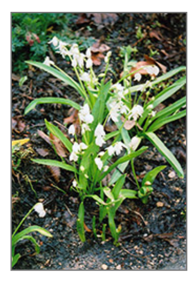
White Spring Squills in bloom

White Spring Squills features dainty spikes of white bell-shaped flowers rising above the foliage in early spring. Its grassy leaves remain green in colour throughout the season.