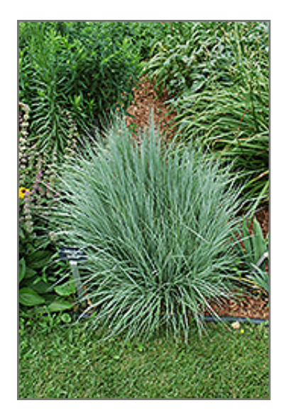
The Blues Bluestem