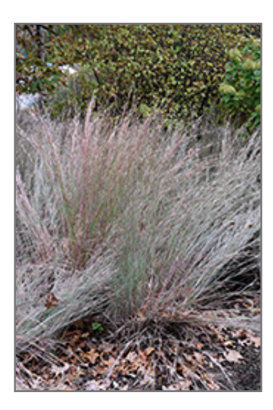
The Blues Bluestem in fall