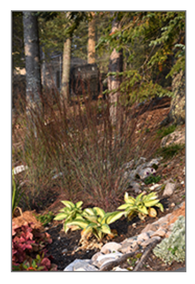
The Blues Bluestem

This plant should only be grown in full sunlight. It is very adaptable to both dry and moist locations, and should do just fine under typical garden conditions. It is considered to be drought-tolerant, and thus makes an ideal choice for a low-water garden or xeriscape application. It is not particular as to soil type or pH. It is somewhat tolerant of urban pollution. This is a selection of a native North American species. It can be propagated by division; however, as a cultivated variety, be aware that it may be subject to certain restrictions or prohibitions on propagation.