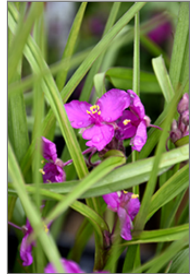
Red Spiderwort flowers