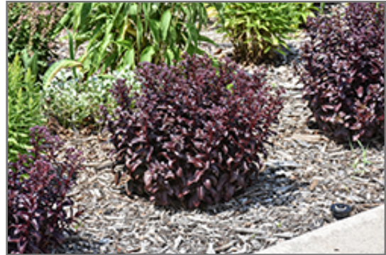
Dark Magic Stonecrop in bloom

Dark Magic Stonecrop will grow to be about 12 inches tall at maturity, with a spread of 20 inches. When grown in masses or used as a bedding plant, individual plants should be spaced approximately 16 inches apart. It grows at a fast rate, and under ideal conditions can be expected to live for approximately 15 years. As an herbaceous perennial, this plant will usually die back to the crown each winter, and will regrow from the base each spring. Be careful not to disturb the crown in late winter when it may not be readily seen!