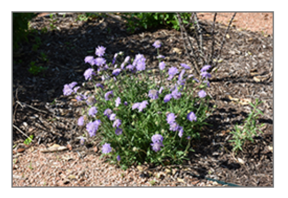
Butterfly Blue Pincushion Flower in bloom