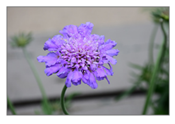
Butterfly Blue Pincushion Flower flowers