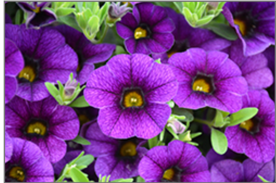
MiniFamous Uno Blue Calibrachoa flowers

MiniFamous Uno Blue Calibrachoa is a dense herbaceous annual with a trailing habit of growth, eventually spilling over the edges of hanging baskets and containers. Its medium texture blends into the garden, but can always be balanced by a couple of finer or coarser plants for an effective composition.