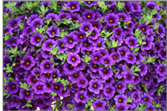
MiniFamous Uno Blue Calibrachoa flowers