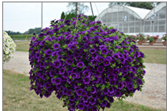
MiniFamous Uno Blue Calibrachoa in bloom