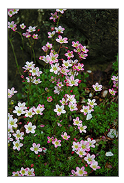
Toyo Yatsubusa Saxifrage flowers

Toyo Yatsubusa Saxifrage features tiny shell pink star-shaped flowers with lemon yellow eyes and cherry red tips at the ends of the stems from early to late spring, which emerge from distinctive red flower buds. Its needle-like leaves remain emerald green in colour throughout the season.