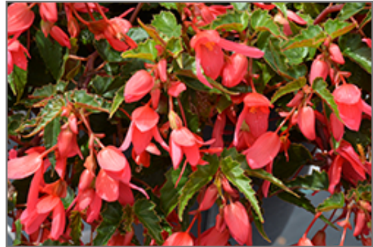
Groovy Rose Begonia flowers