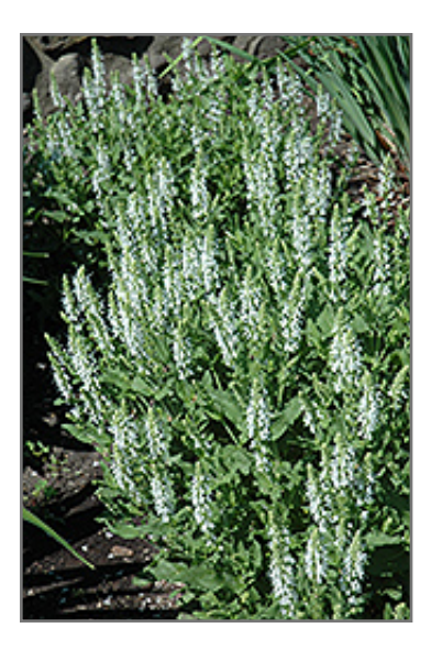
Snow Hill Sage in bloom

This plant should only be grown in full sunlight. It is very adaptable to both dry and moist locations, and should do just fine under typical garden conditions. It is not particular as to soil type or pH. It is somewhat tolerant of urban pollution. This particular variety is an interspecific hybrid. It can be propagated by cuttings; however, as a cultivated variety, be aware that it may be subject to certain restrictions or prohibitions on propagation.