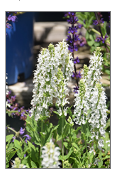
Snow Hill Sage flowers