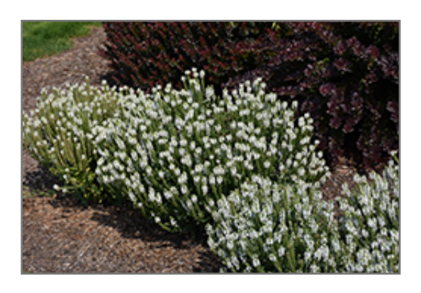
Snow Hill Sage in bloom

Snow Hill Sage is recommended for the following landscape applications;