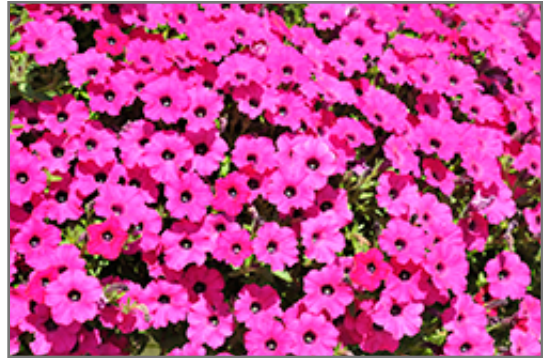
Itsy Magenta Petunia flowers

Itsy Magenta Petunia is a dense herbaceous annual with a trailing habit of growth, eventually spilling over the edges of hanging baskets and containers. Its medium texture blends into the garden, but can always be balanced by a couple of finer or coarser plants for an effective composition.