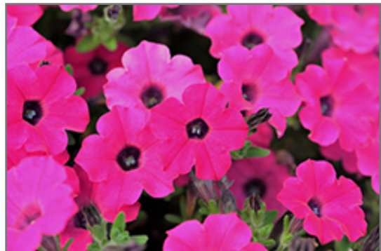
Itsy Magenta Petunia flowers