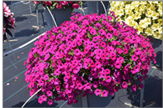
Itsy Magenta Petunia in bloom