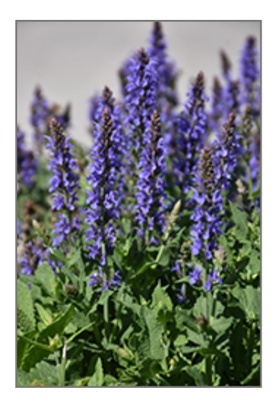
Blue Hill Sage flowers