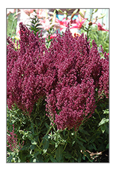
Plumosa Sage flowers

Plant Height: 12 inches Flower Height: 18 inches Spread: 24 inches Spacing: 20 inches Sunlight: O Hardiness Zone: 4a Other Names: Perennial Salvia