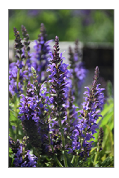
Marcus Sage flowers