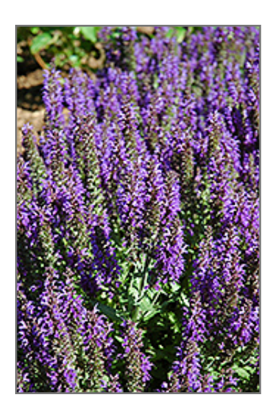
Marcus Sage flowers