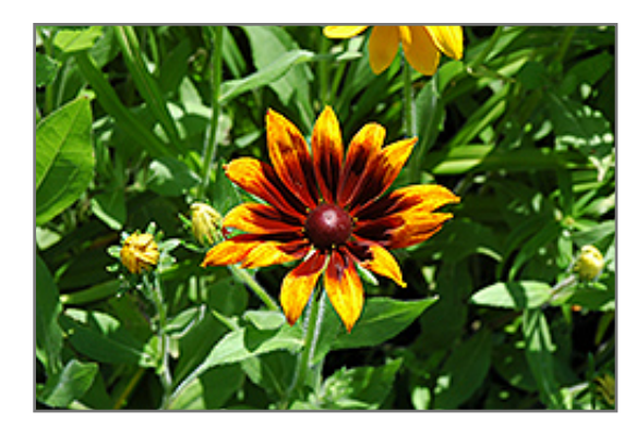
Rustic Colors Coneflower flowers

This is a relatively low maintenance plant, and should be cut back in late fall in preparation for winter. It is a good choice for attracting butterflies to your yard, but is not particularly attractive to deer who tend to leave it alone in favor of tastier treats. It has no significant negative characteristics.