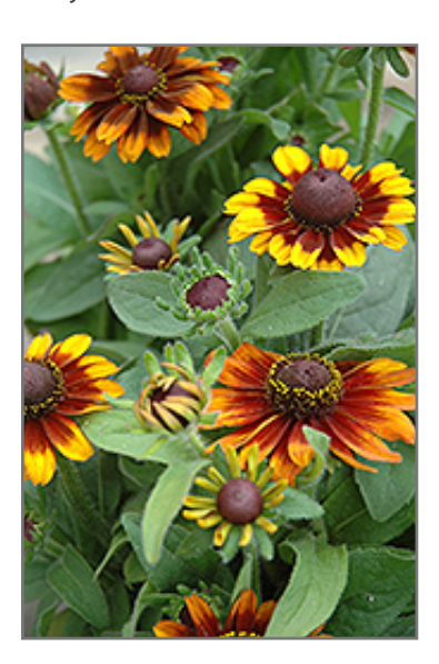
Rustic Colors Coneflower flowers

Rustic Colors Coneflower is recommended for the following landscape applications;