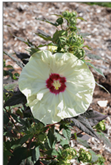
Summerific French Vanilla Hibiscus flowers

Summerific French Vanilla Hibiscus is recommended for the following landscape applications;